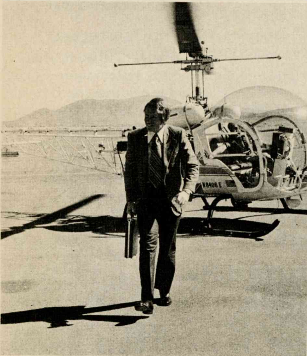
Harry Reid is the hardest working, most effective Lt. Governor in Nevada history.

Harry Reid worked his way through law school in Washington, D.C. as a capitol policeman. He knows his way around Washington and enjoys renewing old acquaintances with friends such as former Vice-President Hubert Humphrey.