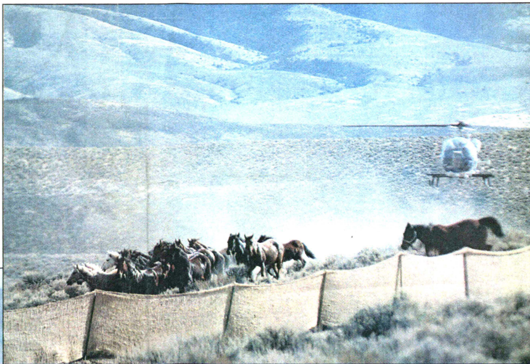
Above, a helicopter herds one of several groups of wild horses into a trap set up in the Clan Alpine Herd Area, which is located in Northeastern Churchill County. The Bureau of Land Management hired a private contractor to round up hundreds of wild horses over the next few weeks. The older ones will be relocated and the younger ones will be put up for adoption.