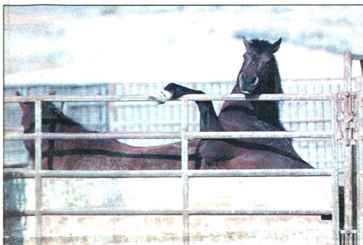
Above, one of the wild horses at the holding area appears reluctant to wait in line for a check-up and an inoculation. And, he is not the only one who wants out. Below, another stubborn fellow forces workers to wait as he tries to turn back at the last minute.