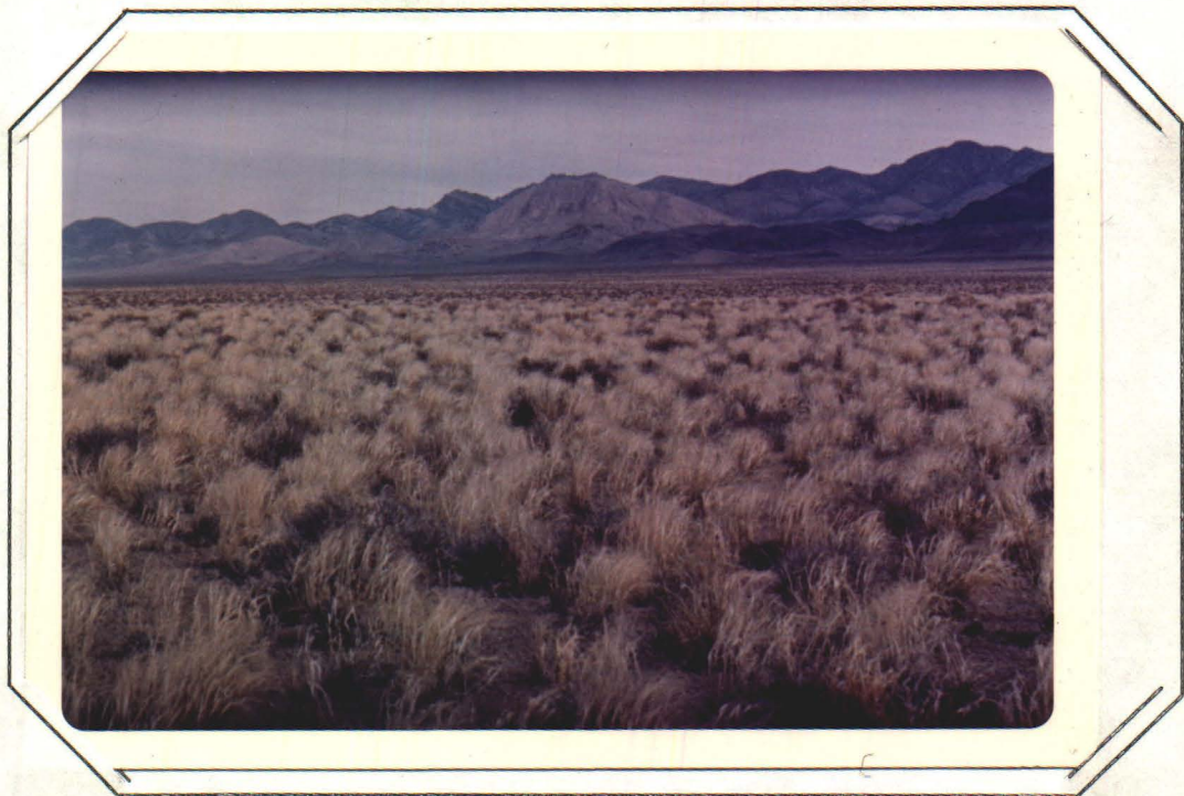
4. 4/29/65. Wild Horse Range about 8 miles from water. Indian ricegrass. Note vigor of grass in relation to that of remaining shrubby species. Average precipitation about 8" annually.