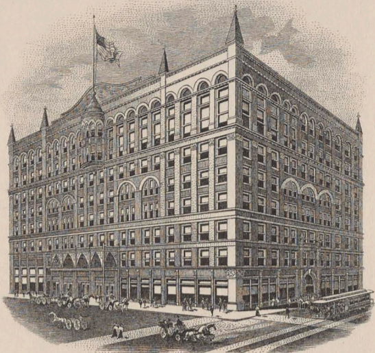
MIDLAND HOTEL. AMERICAN AND EUROPEAN.