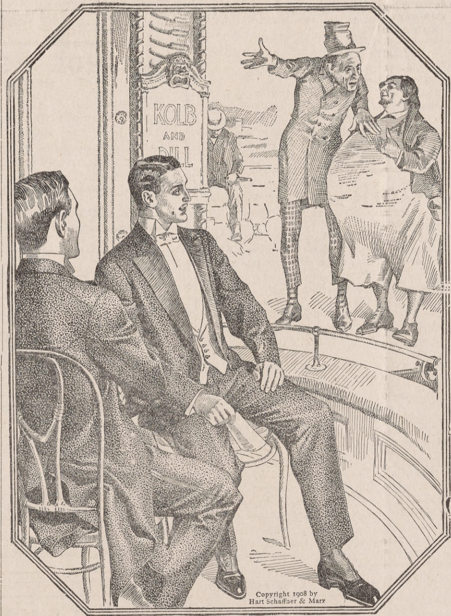
Copyright 1908 by Hart Schaffner & Marx

We can Fit You right; and you can afford the prices we'll ask.