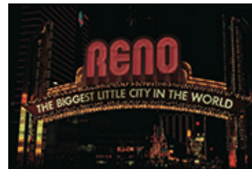
Reno arch on Virginia Street.

Please register for this virtual event in advance by visiting Eventbrite .